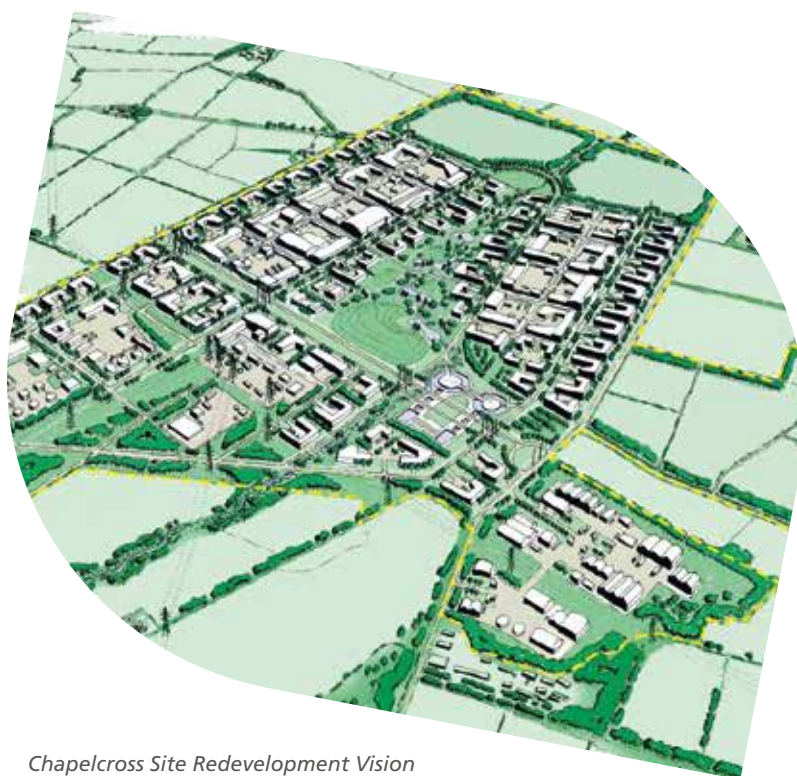
Chapelcross Site Redevelopment Vision