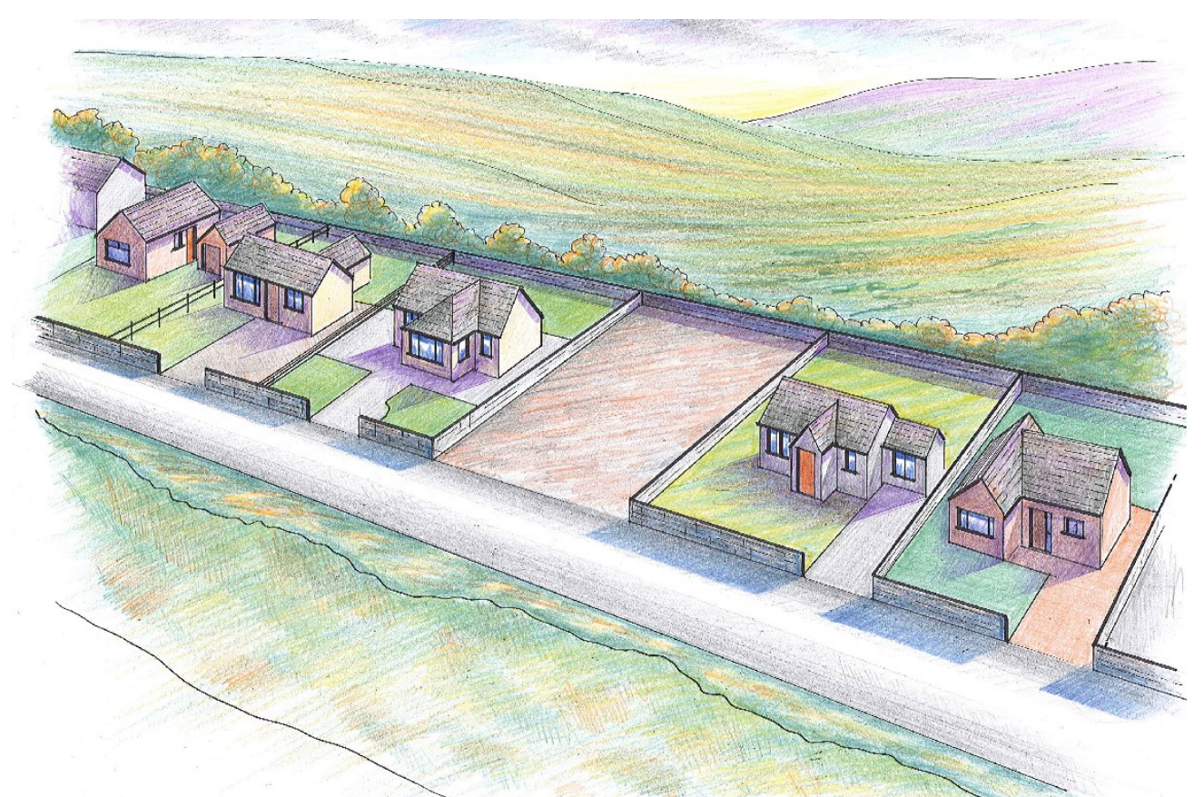
Exmple of an appropriate edge of village site: small field adjacent to the existing settlement edge naturally contained by an established boundary