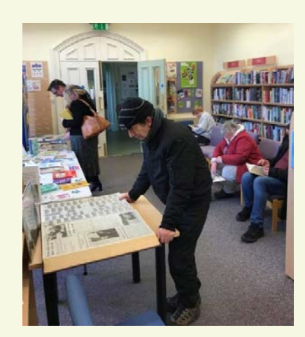
A customer reading forgotten stories in an old Galloway Gazette

Customers also enjoyed Fairtrade drinks at a Friends of Dementia Coffee Morning, where they had fun looking through Galloway Gazettes from years gone by and chatting about the stories they found!