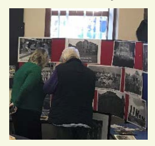
The display at the reminiscence event

Story packs were also used at Moat Brae and visitors to the centre were given the opportunity to enjoy Fairtrade themed storytelling sessions, chocolate tastings and a film about 'Charlie and the Chocolate Factory'.