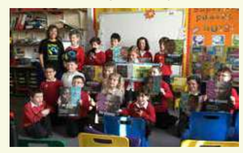
Twynholm Primary School