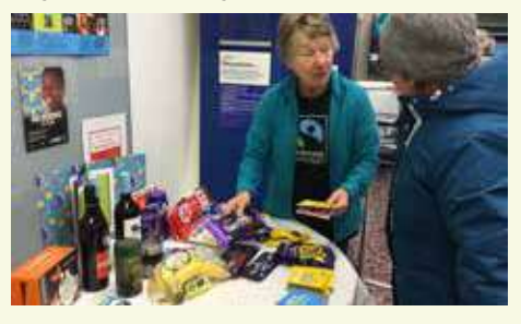
Discussion at the Tesco stall