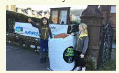
Young helpers at the Coffee Morning

We are now trying to recruit new members and one of our group has designed a poster for display around Kirkcudbright.