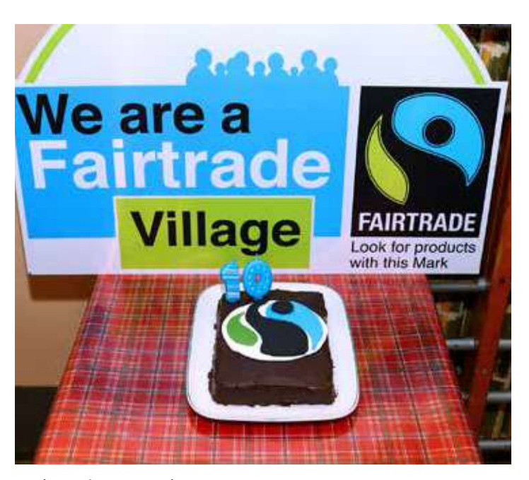
10th anniversary cake