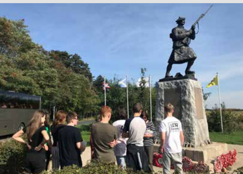
Pupils visited Battlefields in Belgium - September 2018