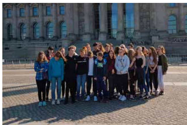
School trip September 2017

and covers the region with an outreach service working for all - jobseekers, employers, schools, practitioners and partners can all access the range of employability services available.